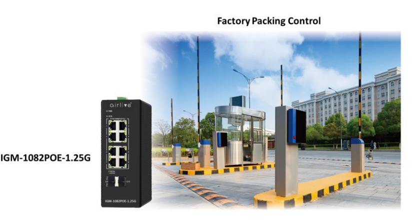
Built-in SFP for long distance transition

Extend the network further with the 1.25G SFP slots. The SFP ports also supports DDM which offers more information about the fiber connection and makes it easier to find any faults or bad connections.